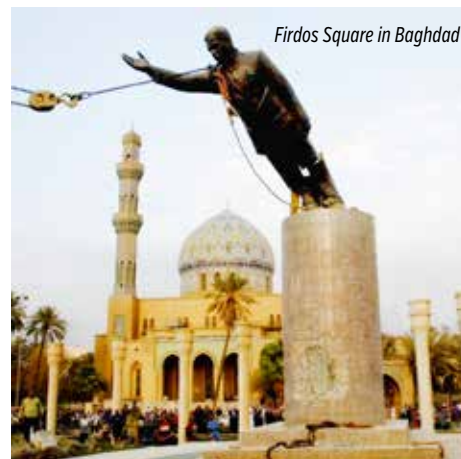
Firdos Square in Baghdad

The predictions of a short, tidy, pre-emptive war seemed true. The air bombardment had gone uncontested. Resistance from the vaunted Republican Guard was sporadically tough, but fading; from the Iraqi regulars, practically non-existent. U.S. leaders' long-held desire for Middle East regime change and purposeful seed-sowing of democracy had finally been realized, and apparently, at a bargain price [for the Coalition anyway].