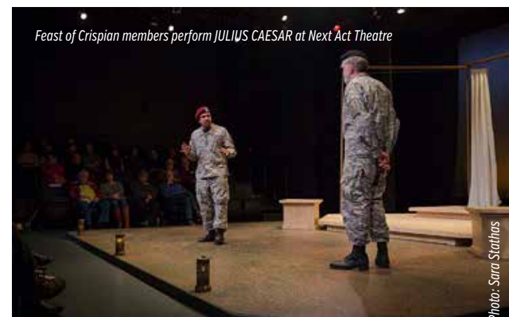
Feast of Crispian members perform JULIUS CAESAR at Next Act Theatre

Military training is designed to suppress emotions in order to foster group cohesion and the ability to work through high stress situations. PTSD further complicates the normal experiencing and expression of human emotions creating poor relationships from domestic life to job expectations. Using the poetic, expressive language of Shakespeare's plays