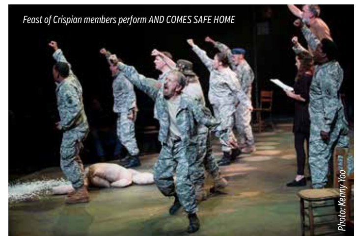
Feast of Crispian members perform AND COMES SAFE HOME