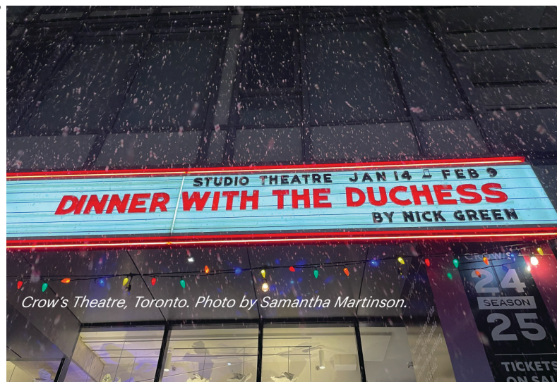
Crow's Theatre, Toronto.