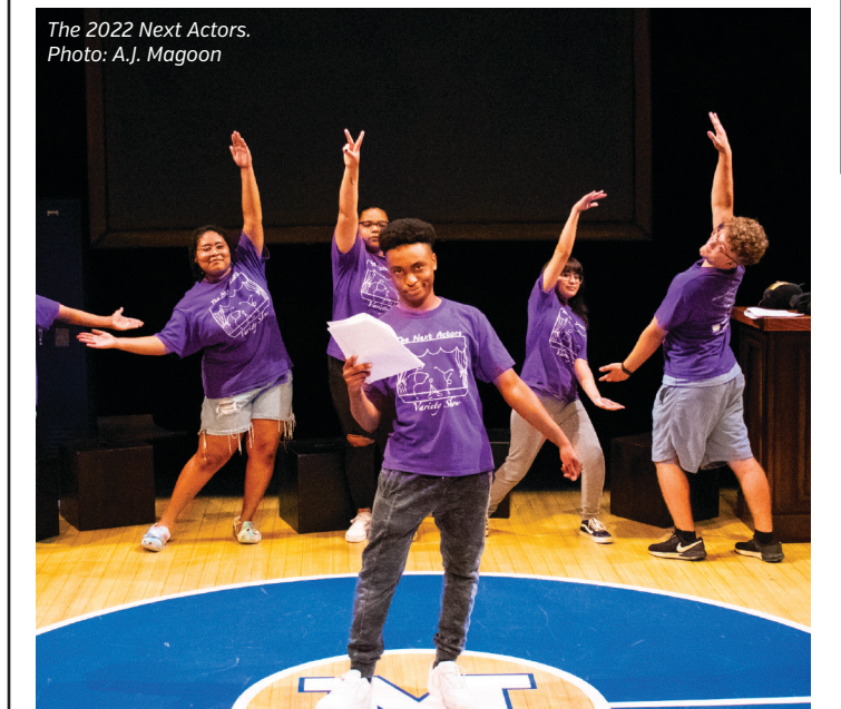
The 2022 Next Actors.

Join us on Saturday, July 27 at 2:00 p.m. for the finale performance of Next Actors: Summer Theatre for Teens 2024! Purchase tickets online ( nextact.org ) or over the phone (414-278-0765). Tickets start at $5 but, if you are able, we encourage you to add a further donation at checkout to support the future of our program.