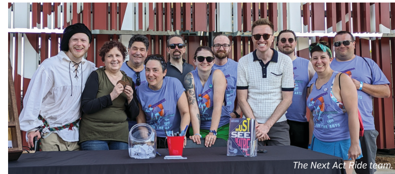
The Next Act Ride team.