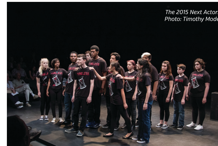
The 2015 Next Actors.

Despite the evolution of the program, the heart of Next Actors is staying the same. "Next Actors, as far as I've been around it, has been a camp that is focused primarily