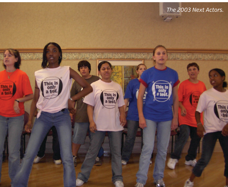
The 2003 Next Actors.